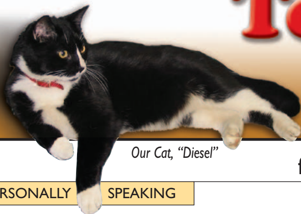
Our Cat, "Diesel"